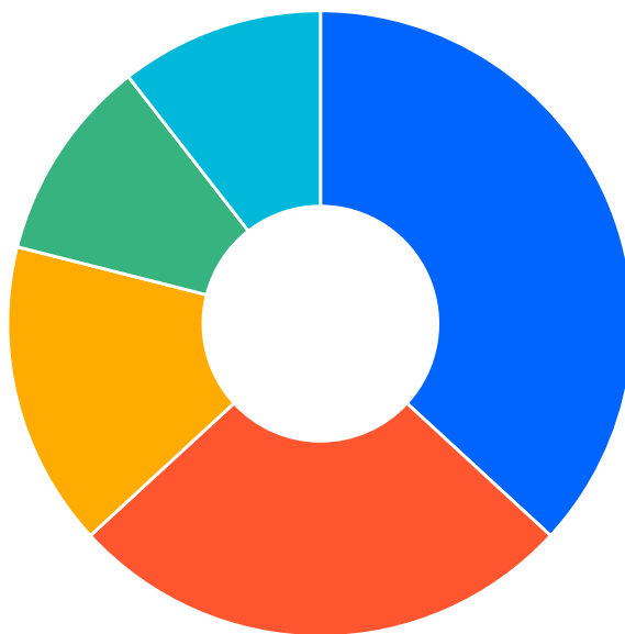
Pie Chart: New issues created last week

Issue Type Total Issues: 19 • New feature (7) • Change Request (5) • Task (3) • Bug (2) • Documentation (2)